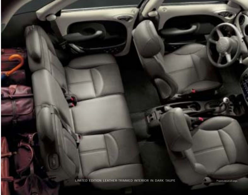
LIMITED EDITION LEATHER-TRIMMED INTERIOR IN DARK TAUPE