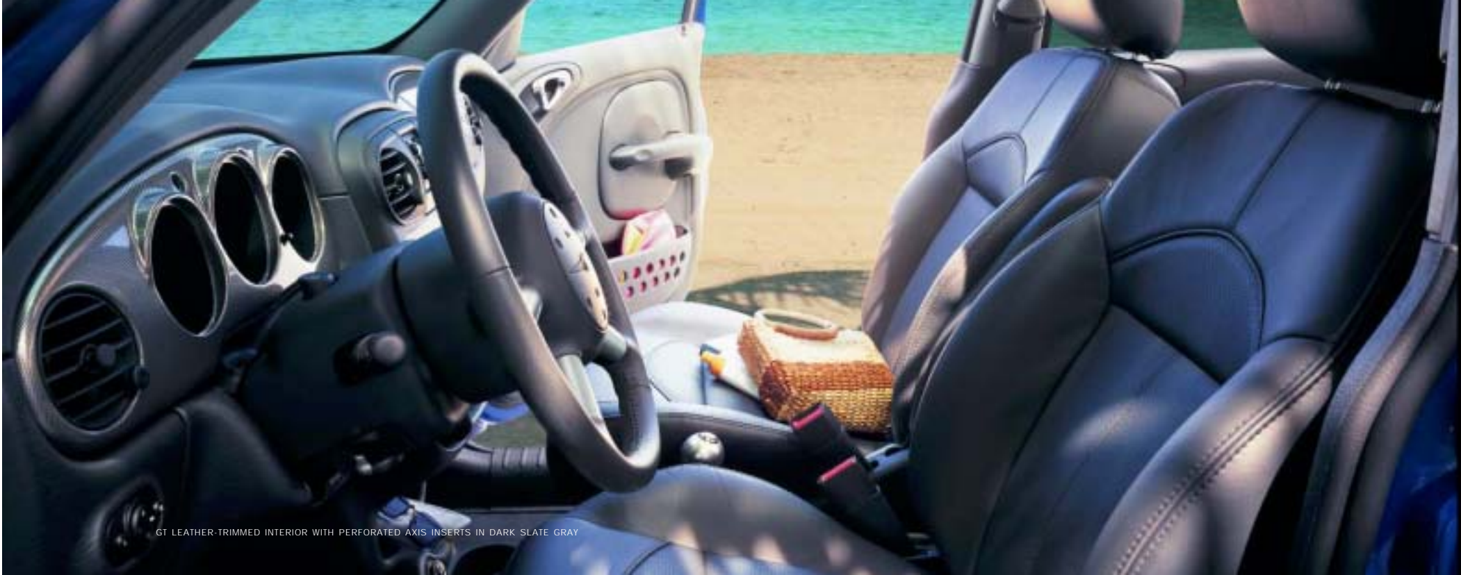
GT LEATHER-TRIMMED INTERIOR WITH PERFORATED AXIS INSERTS IN DARK SLATE GRAY